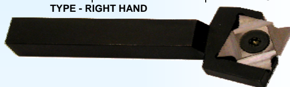
TYPE - RIGHT HAND